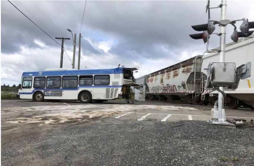
Figure 3. Damaged bus