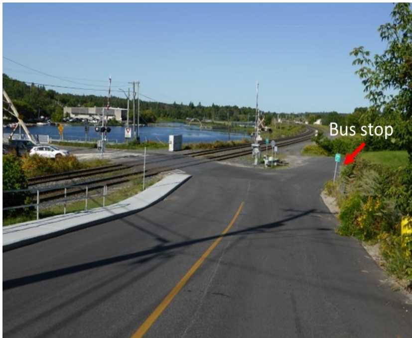
Figure 4. View from the bus on Government Road approaching the crossing

While making the left turn toward the crossing, the driver observed in the right side mirror 2 people rushing toward the city bus stop. Given the proximity of the bus to the crossing and the driver's belief