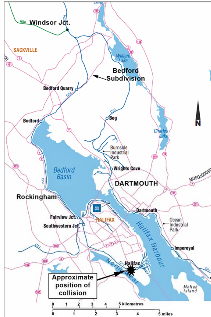
Figure 1. Halifax map showing location of collision

Canadian National (CN) train Q121-11-03 (the CN train) consisted of four locomotives, weighed approximately 790 tons, and was about 285 feet in length. The fourth locomotive was shut down, but the brakes were operative. The engines were proceeding from the CN Fairview shop tracks in Halifax, Nova Scotia, on the Bedford Subdivision to pick up container cars at Halifax Ocean Terminals (HOT) (see Figure 1).