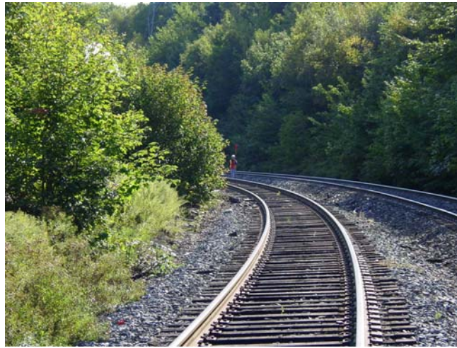
Photo 1. Track curvature and sightlines at Mile 1.3 looking eastward