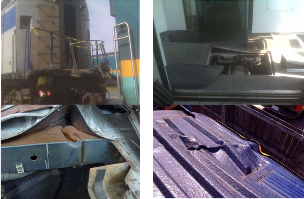
Photo 3. Damaged VIA equipment (top left: locomotive end damage, top right: buckled car vestibule floor, bottom left: collapsed crash management zone, bottom right: damaged car roof)

At the time of the accident, the weather was mostly cloudy, with winds from the south-southwest at 22.2 km/h and a temperature of 22°C.