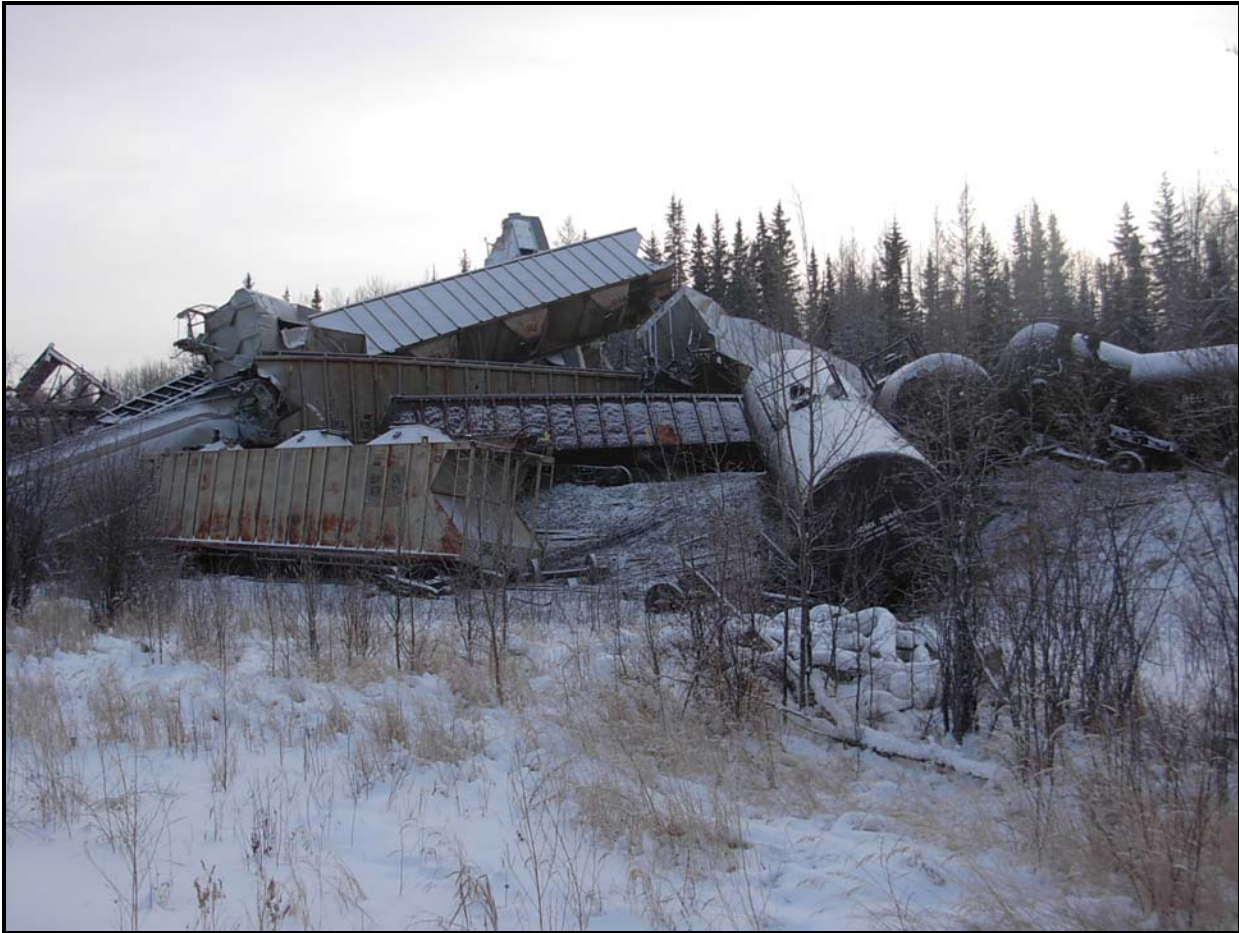
Photo 1. View of derailment, looking east