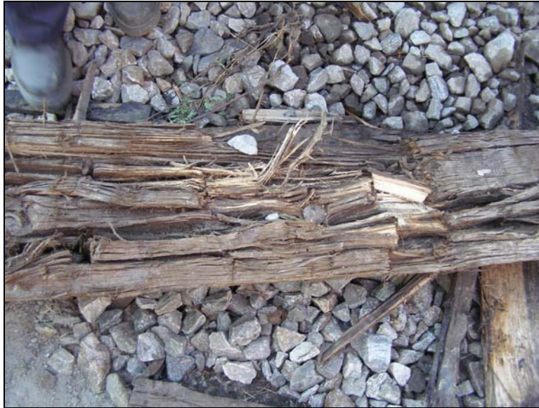
Photo 2. Track tie from the north approach

Seventeen bridge ties and the broken knuckle were sent to the TSB Engineering Laboratory (LP 045/2006 and LP 108/2006) for examination. The following observations were made: