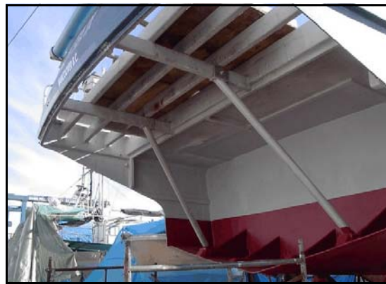
Photo 4. Examples of platform deck extension to accommodate extra traps

The Stacked Licence policy permits vessel owners to carry 500 prawn traps on board. To facilitate this, an aluminum platform deck extension weighing about 181 kg was added to the after end of the Morning Sunrise . This extension was not included in the vessel's length overall. Around the same time, a similar aluminum platform, extending approximately 2.75 m aft from the top deck of the housework, was constructed. This added a further weight of about 227 kg to the vessel. The 408 kg weight of the added structures was above the vessel's centre of gravity. These modifications were carried out by a local welding shop without consulting a naval architect or TC.