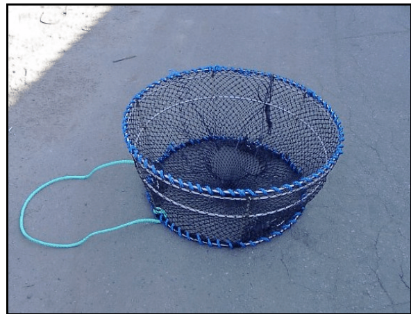
Photo 3. Fishing prawn trap

In 2001, to control the practice of fishers hauling in their traps two to three times a day in order to maximize their catch, another management measure was introduced: commercial trap hauling was restricted to once per day between 0700 and 1900.