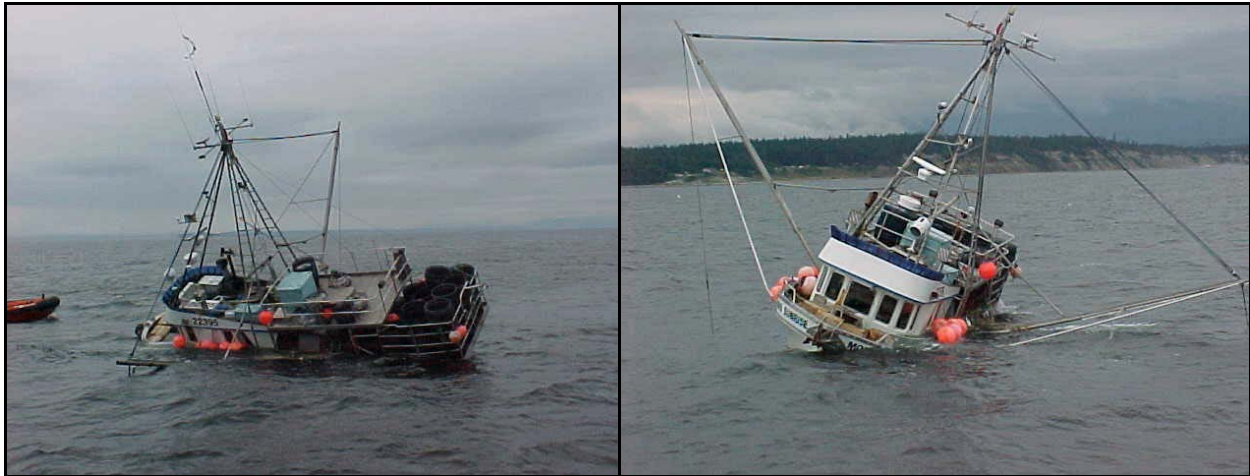
Photo 1. The Morning Sunrise during capsizing

A similar aluminum platform extended approximately 2.75 m aft, from the top deck of the housework. This was used to store various fishing equipment and a tote that was temporarily used to store prawns before freezing.