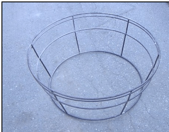
Photo 2. Shell of trap before cordage is added

Also in 1995, in order to deter fishers from jury-rigging their prawn traps to maximize their catch, DFO set upper limits for trap volume and mesh size. Since these limits did not take into consideration trap weights, licence holders opted to make the traps more robust by progressively increasing the trap weights from 2 kg to 5 kg. This enabled the traps to withstand the weight of the catch, and the licence holders to better their catch size.