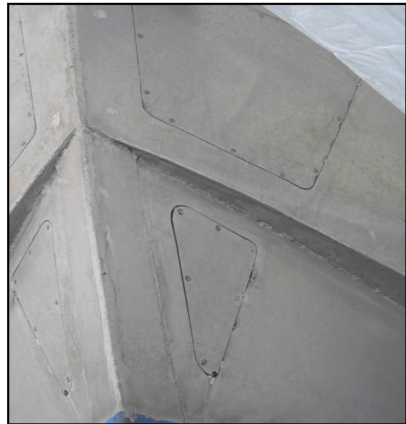
Photo 5. Examples of vessels' overall length being reduced by opening the end compartment to the sea. This can compromise the watertight integrity of those vessels. These modifications are done to meet the DFO length restrictions. Note: Openings made in the bow section of the vessel on the photo to the left. Drain holes at the bottom of the triangular plate on the photo to the right.