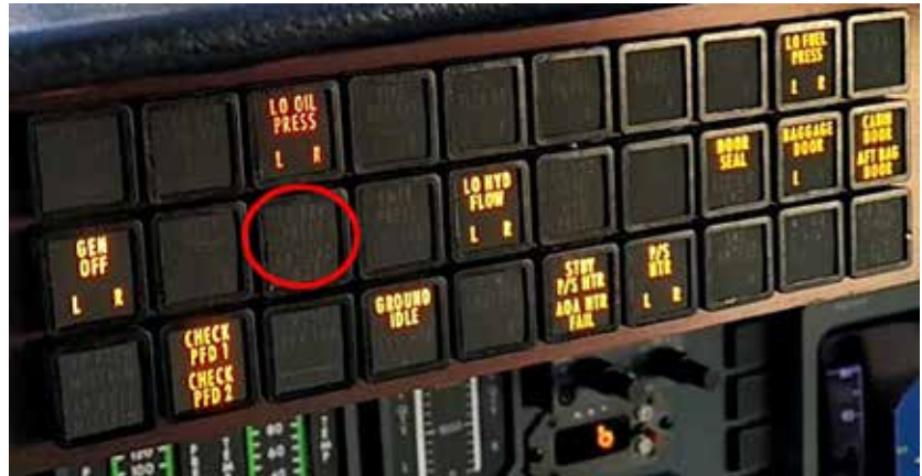
Figure 5. Annunciator panel during on-site examination of occurrence aircraft

In this occurrence, the emergency brake system was not activated when the aircraft did not respond to the brake pedal inputs prior to the collision. Pilots should be cognizant that malfunctions may occur at any time, and they should be prepared to initiate emergency procedures. Conducting a brake check to verify proper brake operation on initial movement of the aircraft may alert pilots to issues with the brake system.