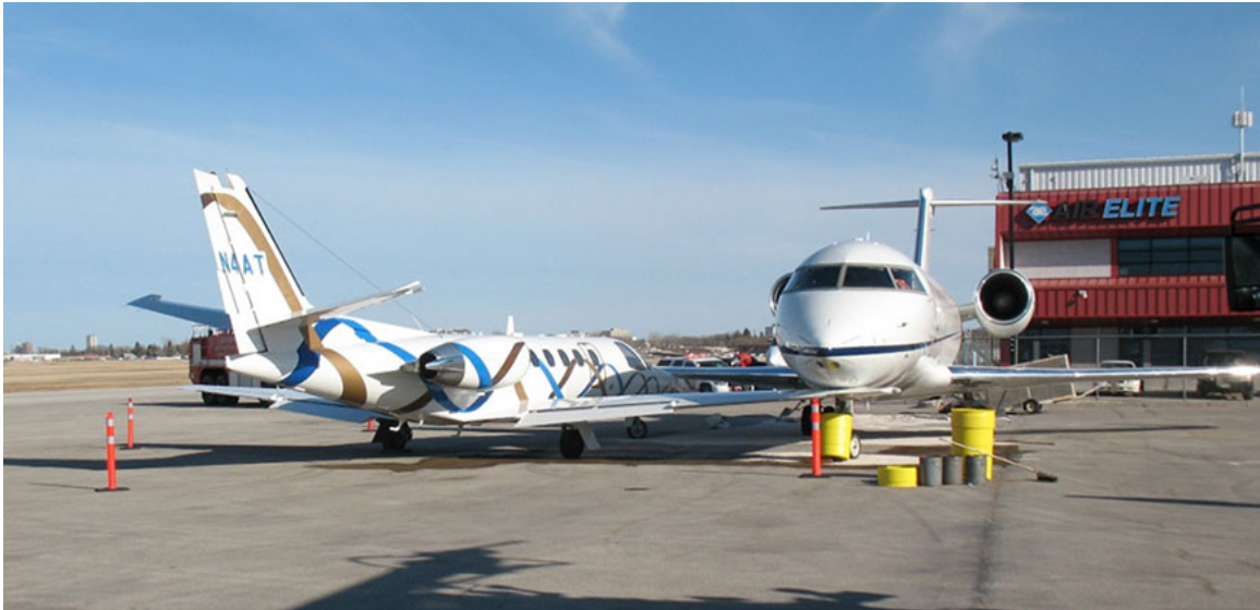
Figure 1. Collision site, showing N4AT (left) and C-FXWT (right)

The pilot of the Cessna subsequently shut down the aircraft's engines, and he and the passenger exited the aircraft through the cabin door. Neither was injured. Fuel was observed leaking from the Cessna's right wing, and ground crew used a spill response kit to ensure the leak was contained. The ground crew also reported the collision by phoning the airport fire hall directly. There was no fire, and the emergency locator transmitter did not activate.