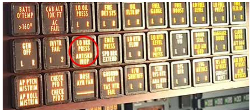
Figure 2. Annunciator panel in test mode with all lights illuminated and the LO BRK PRESS annunciator light circled

Power braking action is actuated by the master cylinders that are connected to the top of each rudder pedal and that are commonly referred to as toe brakes. When the pilot applies the toe brakes, hydraulic pressure produced by the master cylinders actuates the power brake and anti-skid valve that applies power-assisted braking action to the wheels.