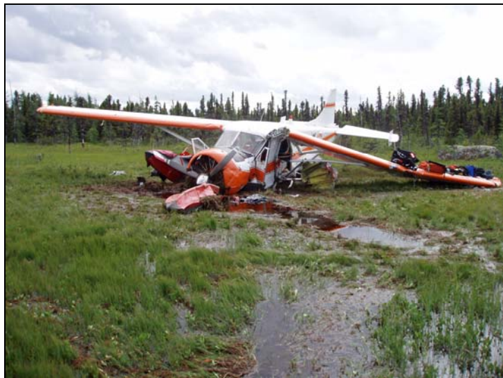
Photo 1. The damaged aircraft after the accident