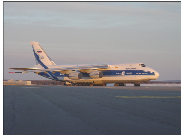
Photo 1. AN 124-100, registration RA-82078

The Volga-Dnepr Airlines Flight 2100 (VDA 2100) had departed Greer, South Carolina, United States, at 2236 Newfoundland daylight time. 1 The en-route portion of the flight was uneventful. Before descent into Gander, it had been decided to approach and land on Runway 03/21, the longer of the two available runways. The Volga-Dnepr Airline crews, who were frequent visitors to Gander, usually used the longer runway if conditions permitted.