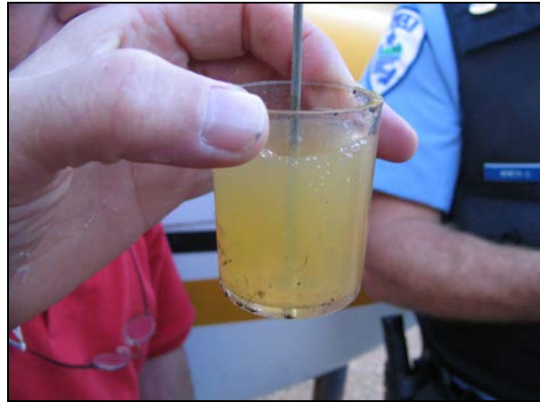
Photo 1. Water from gascolator

The day after the accident, the aircraft was examined at the Saint-Hubert Airport, Quebec, and the following observations were made: