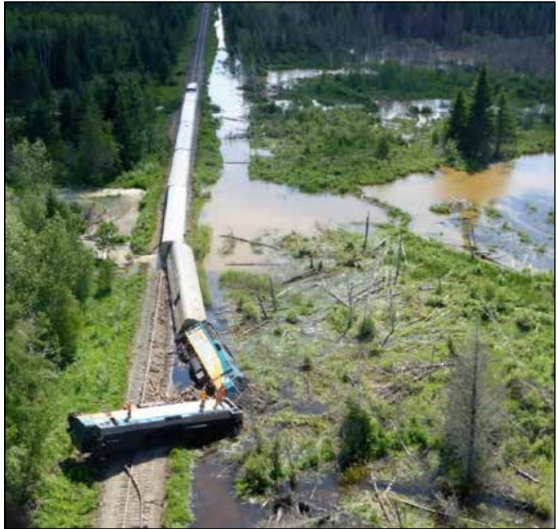
Figure 2. Derailed locomotives, baggage car, and passenger coach

At the time of the occurrence, the temperature was 11 °C. In the 4 days preceding the occurrence, a total of 101.5 mm of rain had fallen. On 04 July 2018, Environment and Climate Change Canada issued a rainfall warning bulletin that forecasted heavy rains from Hudson Bay to Porcupine Plain, Saskatchewan.