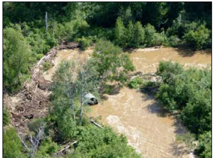
Figure 3. Washed-out highway culvert with related debris

With the highway breached, the excess water flowed overland, flooding the railway right-of-way between 2 railway culvert locations (i.e., Mile 23.53 and Mile 24.23). The increased water volume