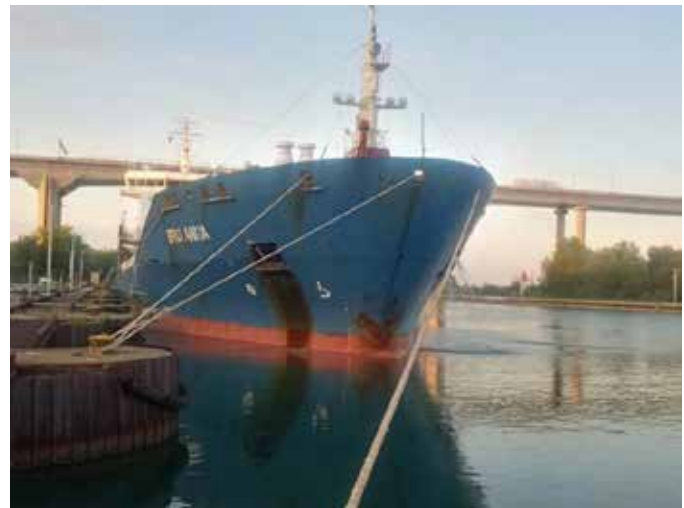
Figure 1. The Bro Anna

The bridge is equipped with 2 very high frequency (VHF) radiotelephones, an electronic chart display and information system (ECDIS), 2 radars, and 3 conning stations: 1 amidships, 1 port, and 1 starboard. The conning stations are fitted with controls for the main engine, the controllable pitch propeller, the bow thruster, and the steering gear (Figure 2).