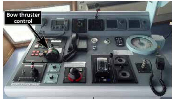
Figure 2. Port conning station showing location of bow thruster control

At 1810, the vessel lost all electrical power, and the main engine, bow thruster, and steering gear shut down. The vessel continued to proceed forward under its own momentum and started swinging to port. Shortly thereafter, the emergency generator automatically activated and electricity was restored to the vessel's essential safety components, which included the steering gear, navigation lights, emergency lights, communication systems, and alarm systems.